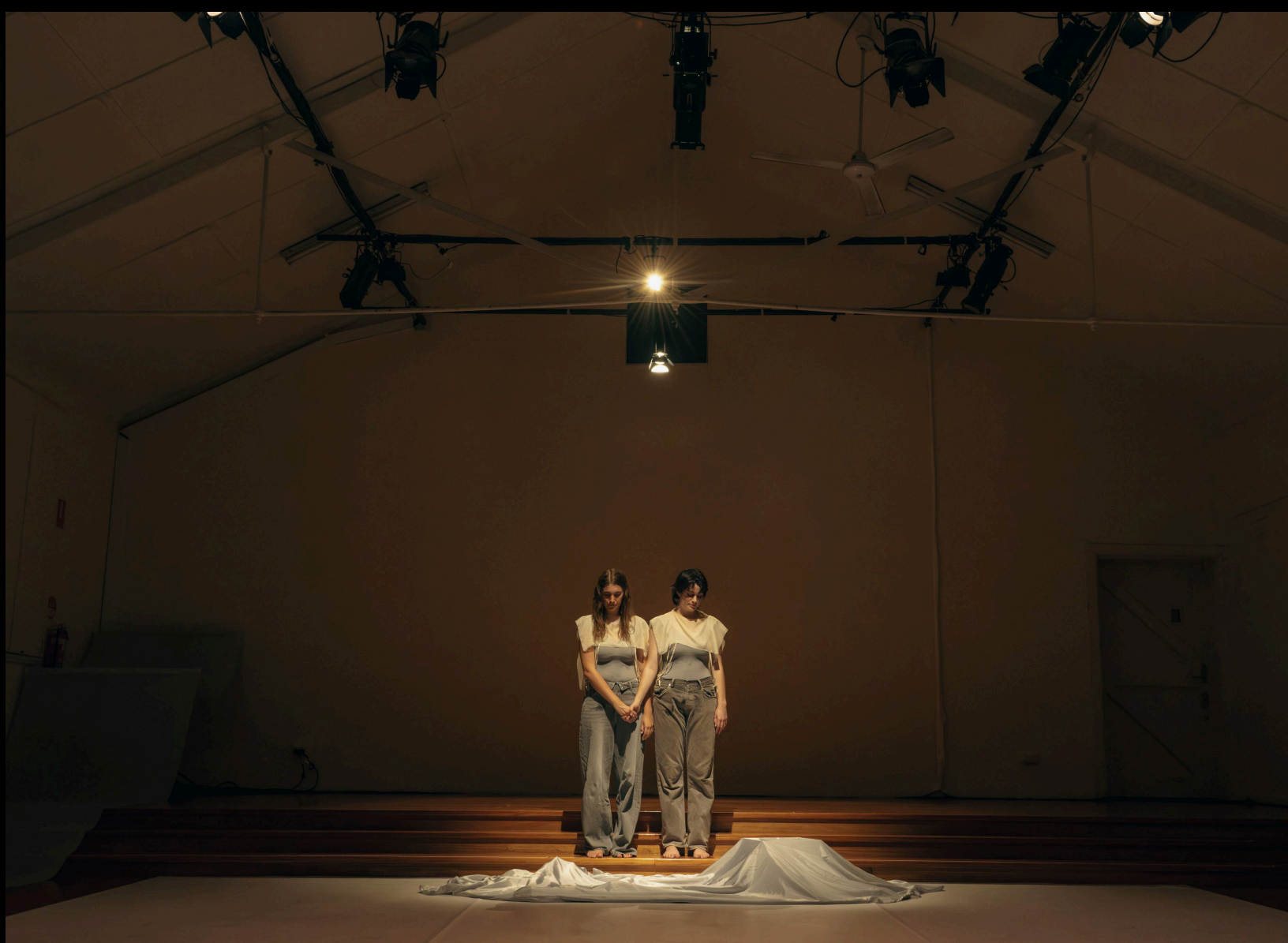
Pool (2026), by Alex Dobson.

If Act 1 is a looking away from the audience, Act 2 interrogates us directly – two pairs of eyes forcing us to look back and witness the puddles of sweat and water and ice cubes. And Act 3 feels like a request for us to look within, to look inwards.