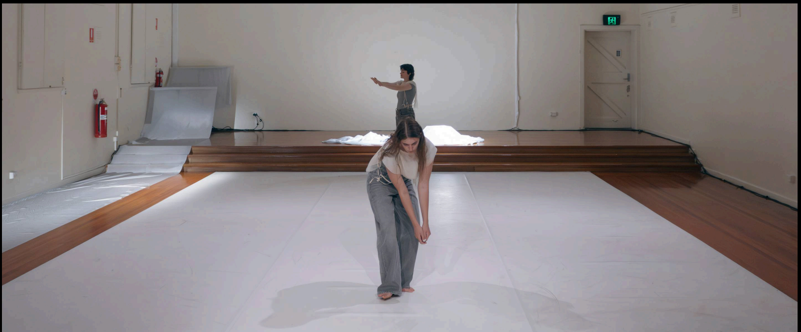
Pool (2026), by Alex Dobson.

As I leave Dancehouse, the outside world – its noises, its sensations, its images – are now heightened, a poetry revealed to me by the dance. The sunset is pink and a cacophony of corellas are shrieking, noisy, unrelenting, almost drowning out the sounds of the cars racing by along Princes Street. A light rain gently touches my skin, my lips. I realise suddenly that I'm thirsty and yet filled with water. Across the street, on a balcony two corellas are pressed up close against one another. They snuggle, bump heads and just like the dancers, come together and pull away. Alive, creaturely, completely dependent, utterly interdependent.